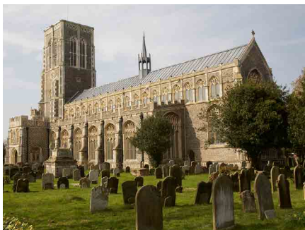
St Edmund's church, Southwold, awarded a National Churches Trust grant in 2017.

You also need to decide who you would like to be your Executor. This is the person that ensures that your wishes are carried out properly. You could appoint a family member, friend or your solicitor, and it does not matter if the Executor benefits from a gift in your Will.