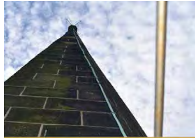
Lightning Protection System Inspection