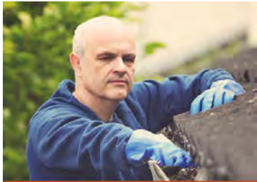
Rainwater Goods Maintenance