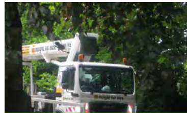
Tree Risk Assessment/Full Surveys