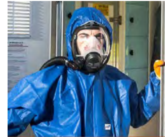
Asbestos Surveys and Removal