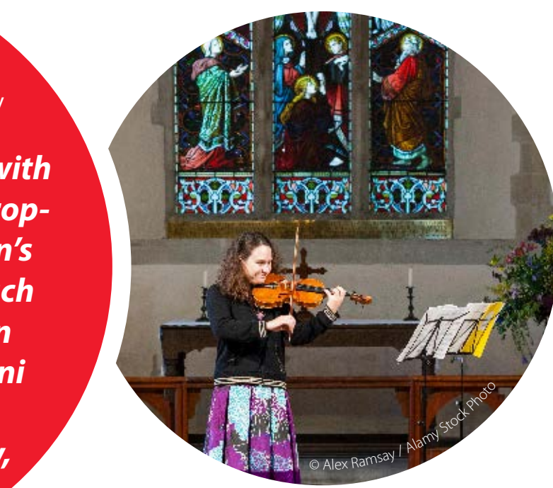
A musician rehearsing in St Andrew's church, Presteigne

Pop Up Pantry at St Stephen's church, Bradford