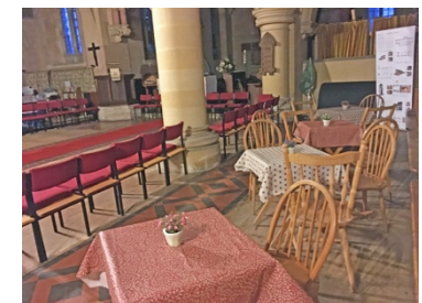
DIY refreshments in the south aisle