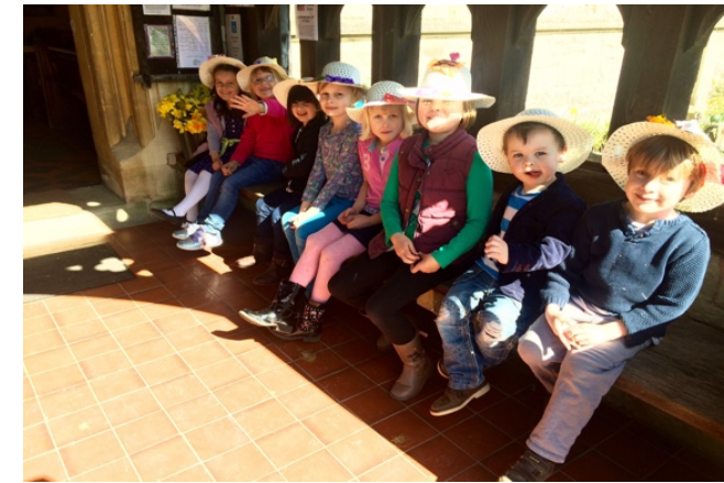
Easter Bonnet making is useful on a sunny day!